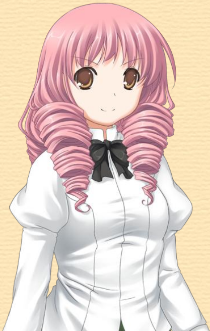
Shiina "Misha" Mikado

Strong willed and forceful, Shizune is definitely the leader type. She's been the class rep, despite being deaf and mute, for as long as her class has had one, and generally takes charge in just about any situation she's placed in. Shizune is known around the school as a fearsome taskmaster, and skilled manipulator, but also as a fair and just leader.